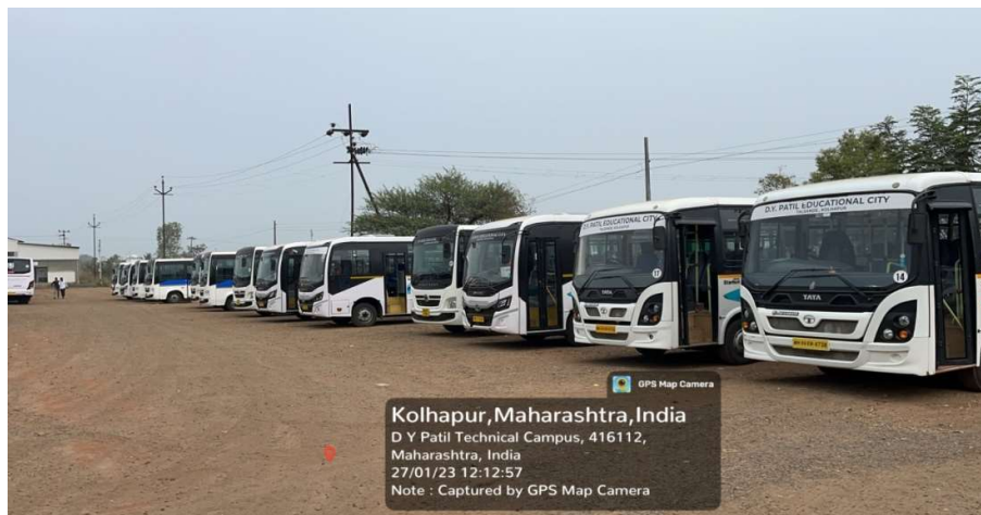
Restricted Entry of Automobiles Bus Parking