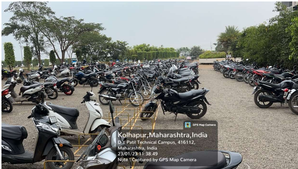
Restricted Entry of Automobiles