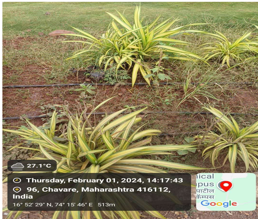
Drip and Sprinkler's for efficient use of Water