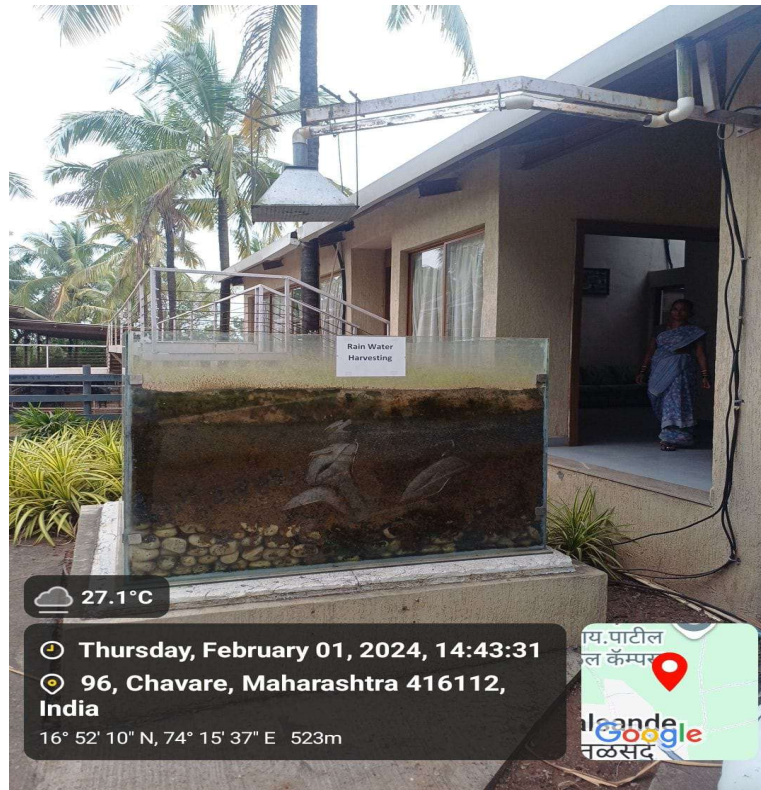
Rain water harvesting