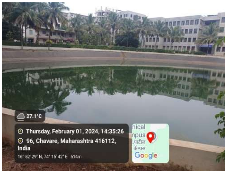
Construction of tanks and bunds