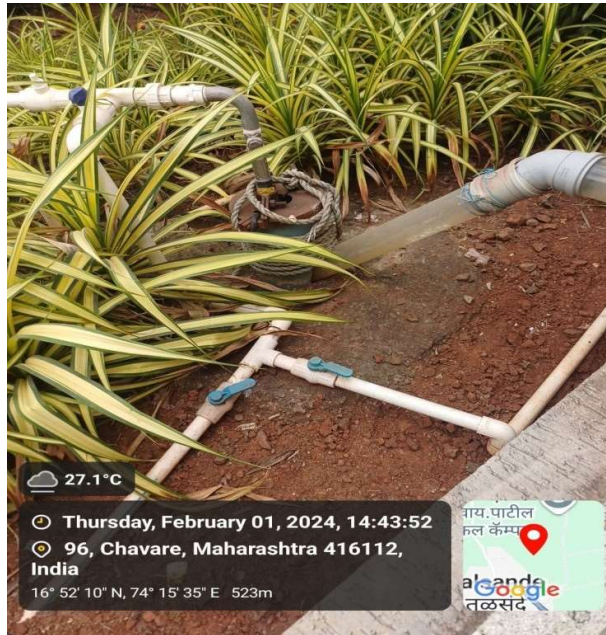
Bore well/Open well recharge