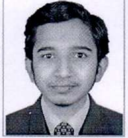
Photo ID: Aadhaar ID