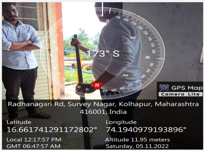
To See depth of Feculence of water with scale