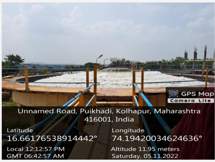
Aeration Tank (Circular type Cascade Aerator)