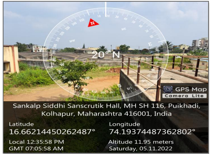
Treated Water Storage Tank