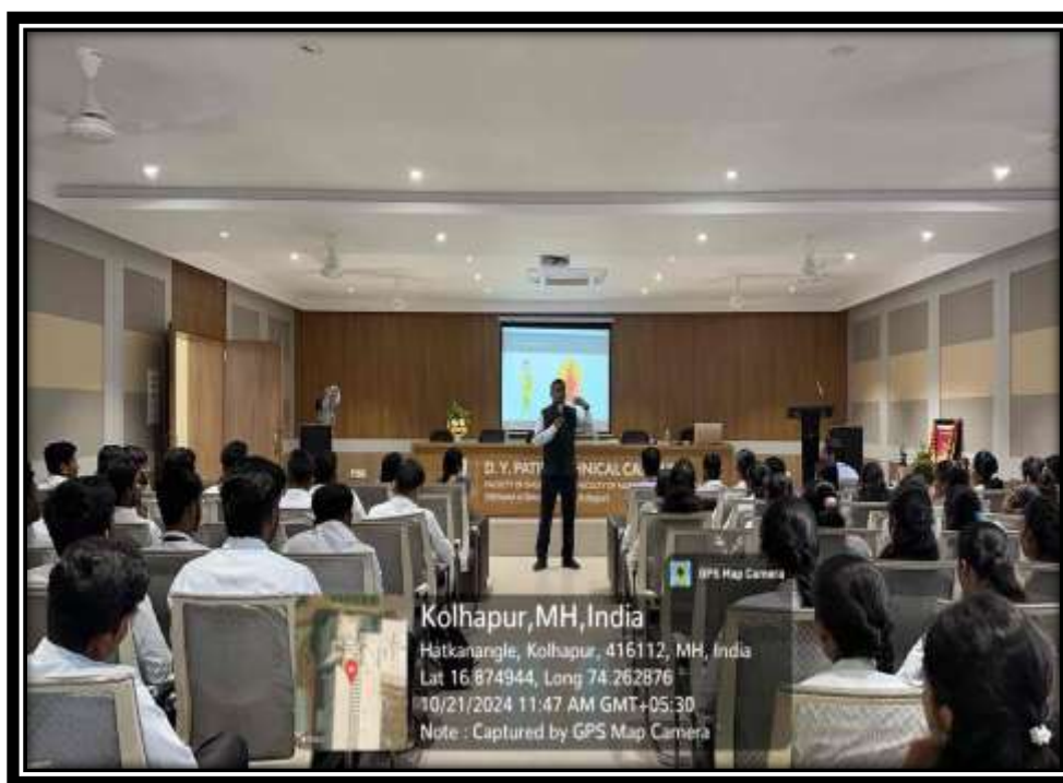
Guest Lecture on Persanality Development