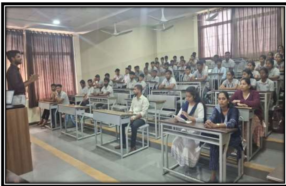
Guest Lecture on PLC & SCADA