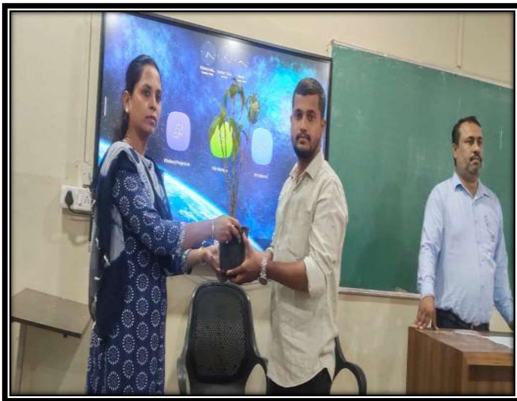
Felicitation of the Guest Member