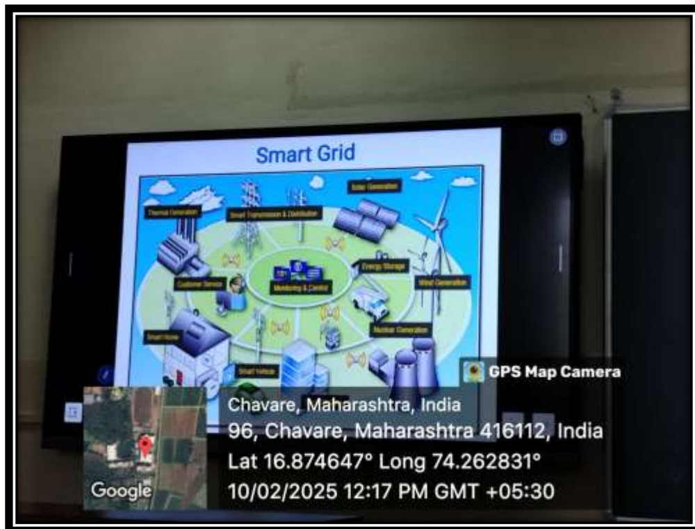
Guest Lecture on “Smart Grid & EV System”