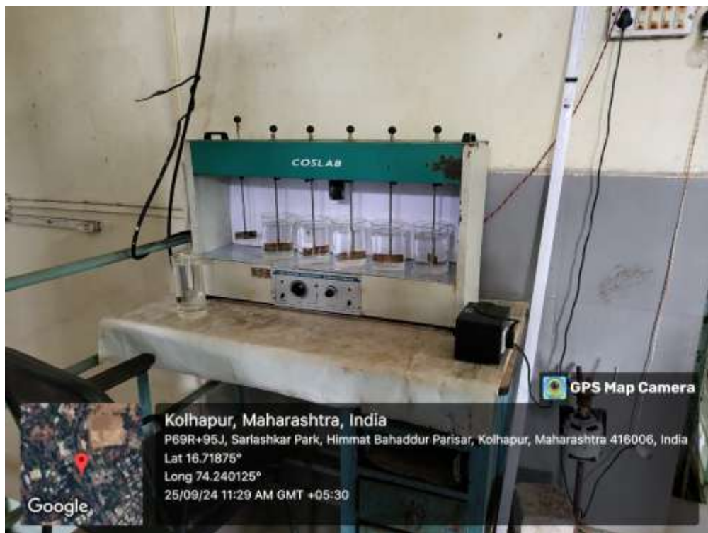
Laboratory test taken at WTP (Jar Test)