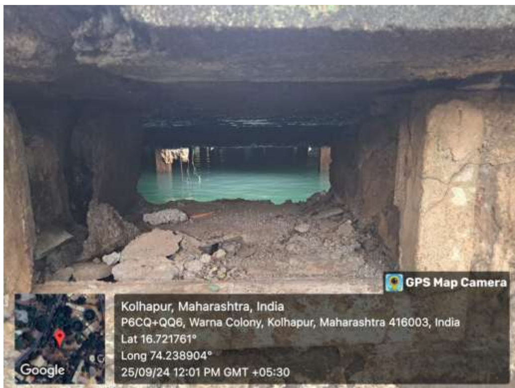
Treated water storage tank