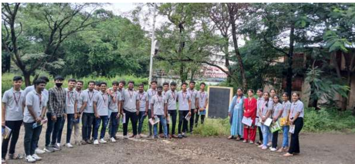
All Students and Staff on the Visit Location