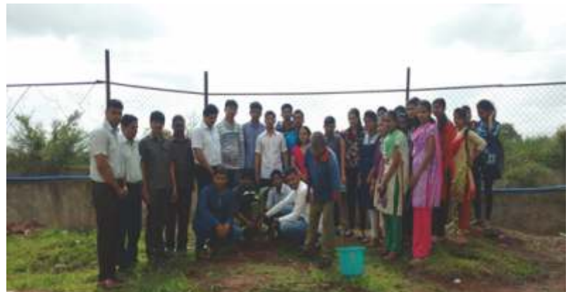
Plantation in college campus