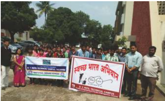
Cleaning of Bhahubli temple at bhahubali, Sangali under NSS activity of clean India.