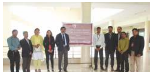
MOU BETWEEN DTC TALSANDE & SAMURUDDHI TBI FOUNDATION ON 06/07/2017