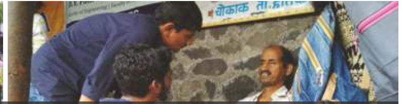
On the date, 10th August '17 Thursday, on occasion of Friendship day at Marutirao Salokhe Vrudhsevashram, a/p Chokak village.