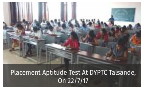
Placement Aptitude Test At DYPTC Talsande, On 22/7/17