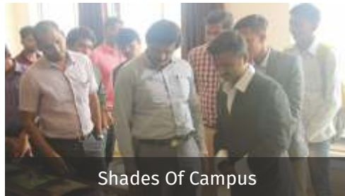
Shades Of Campus