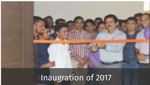
Inaugration of 2017

MESA' organized 2K17 Technical Campus Event which includes Robo Race, Lathewar, Cad War, Isomania and Photography. Total 225 students from various department are participated in this event. This event organized to accelerate technical skills of the student.