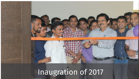
Inaugration of 2017

MESA' organized 2K17 Technical Campus Event which includes Robo Race, Lathewar, Cad War, Isomania and Photography. Total 225 students from various department are participated in this event. This event organized to accelerate technical skills of the student.