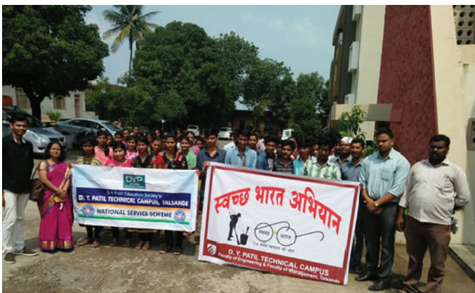
Cleaning of Bhahubli temple at, Narande village, Sangali under NSS activity of clean India.