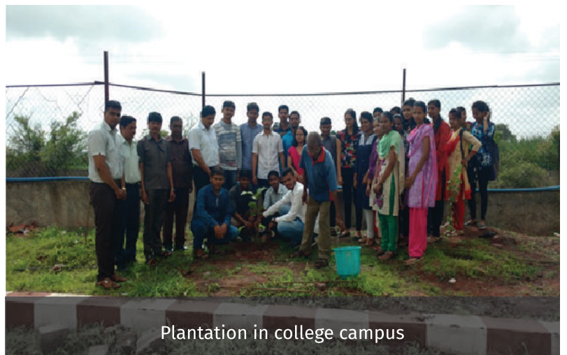
Plantation in college campus