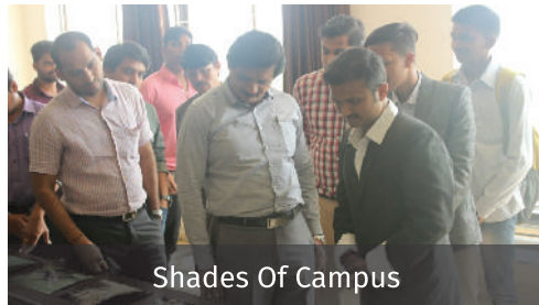
Shades Of Campus